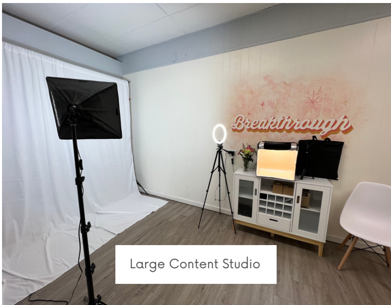
Large Content Studio